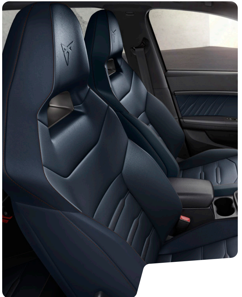
↓ PETROL BLUE LEATHER INTERIOR ■