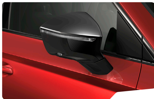
↓ VELVET RED - K1K1 (Premium Metallic)