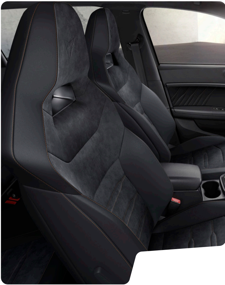
↑ BLACK ALCANTARA INTERIOR ■