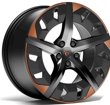
19IN AERO MACHINED SPORT BLACK / COPPER (P9C) ■