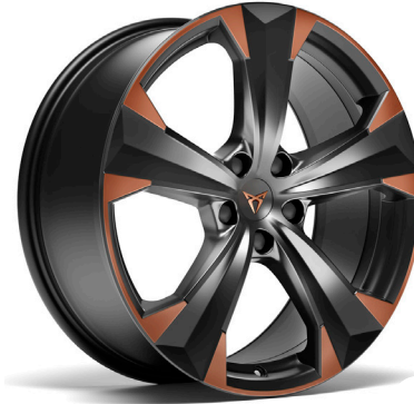
19IN MACHINED SPORT BLACK / COPPER (P8A) ■