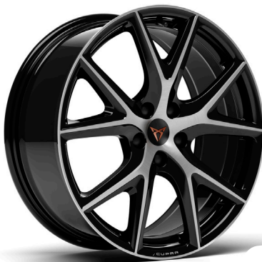
19IN MACHINED R SPORT BLACK / SILVER (PUW) ■