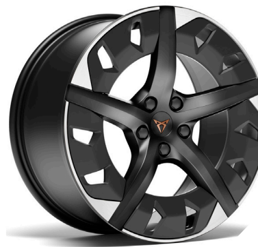
19IN AERO MACHINED SPORT BLACK / SILVER (P8V) ■