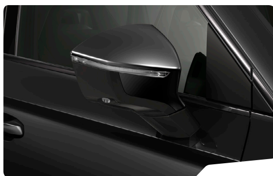
↓ MAGIC BLACK - 1Z1Z (Metallic)