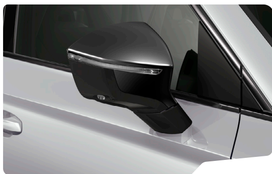
↓ NEVADA WHITE - 2Y2Y (Metallic)