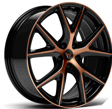
19IN MACHINED R SPORT BLACK / COPPER (PYA) ■