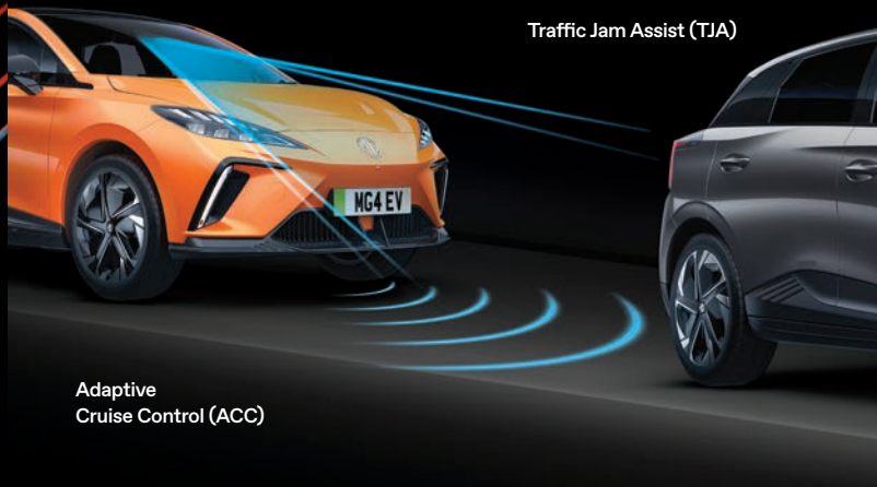
Traffic Jam Assist (TJA)

The MG Pilot suite of high-tech driver assistance technology gives you added confidence on the road. A selection of warning and alert features assists the driver, maintaining safety and simplifying everyday driving.