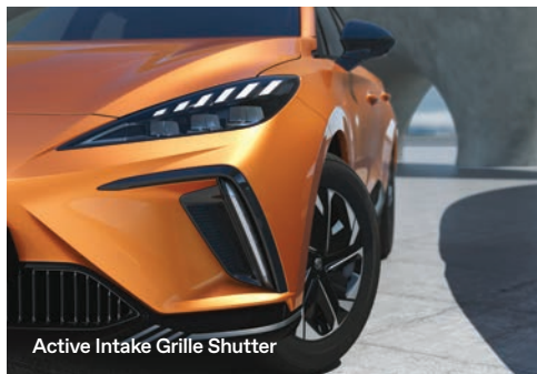
Active Intake Grille Shutter