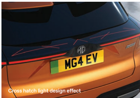
Cross hatch light design effect