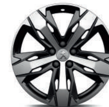
18" Los Angeles