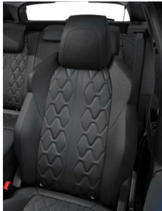
Mistral Nappa leather trim