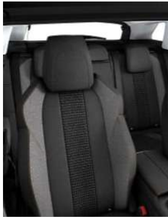
Mistral 'Meco' cloth seat trim