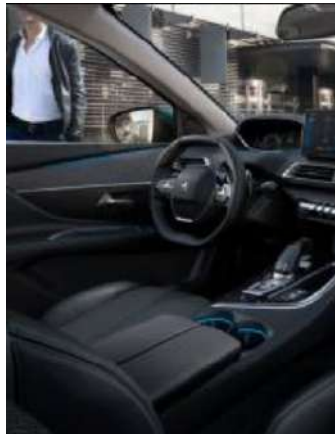
Half Leather effect trim with Mistral 'Colyn' cloth seat trim