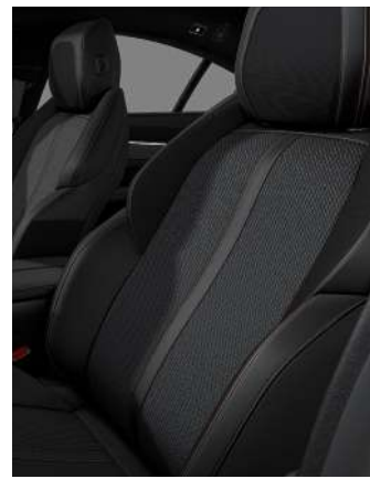
Mistral tri-material 'Belomka' leather effect and 'Ornis' cloth