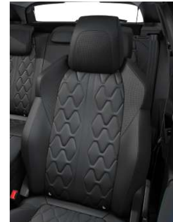
Nappa Mistral full grain leather trim