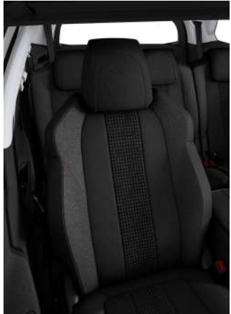
Mistral 'Meco' cloth seat trim