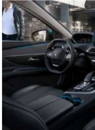
Half Leather effect trim with Mistral 'Colyn' cloth seat trim