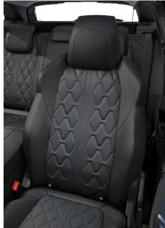
Mistral Nappa leather trim