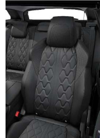
Nappa Mistral full grain leather trim