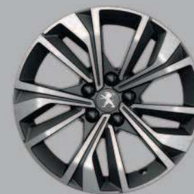
17" MERION diamond cut two tone