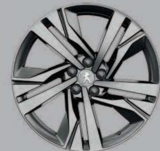
19" AUGUSTA diamond two cut tone