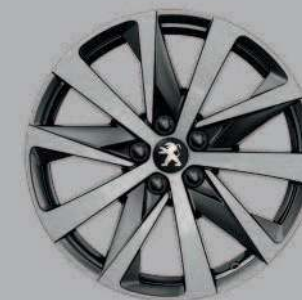
18" HIRONE diamond cut two tone