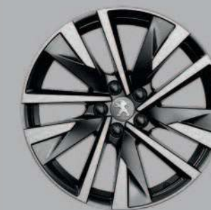
18" SPÉRONE diamond cut two tone