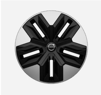
18" 5 Spoke