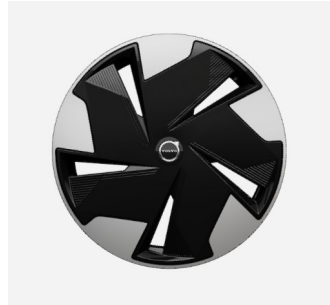
19" 5 Spoke